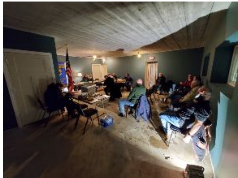
General meeting at possible Life's connection location